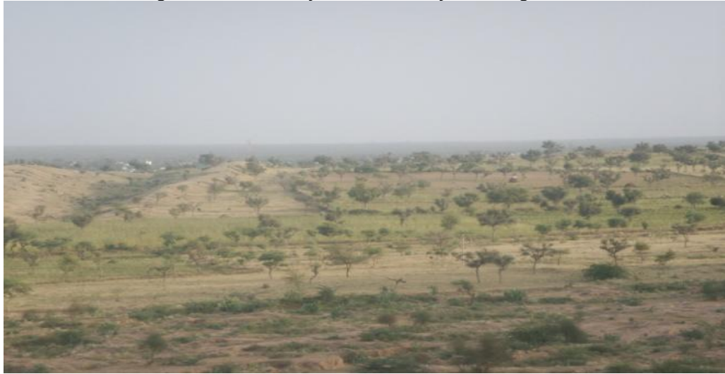
Fig.4. A View of Gravelly and Rocky Plain Vegetation