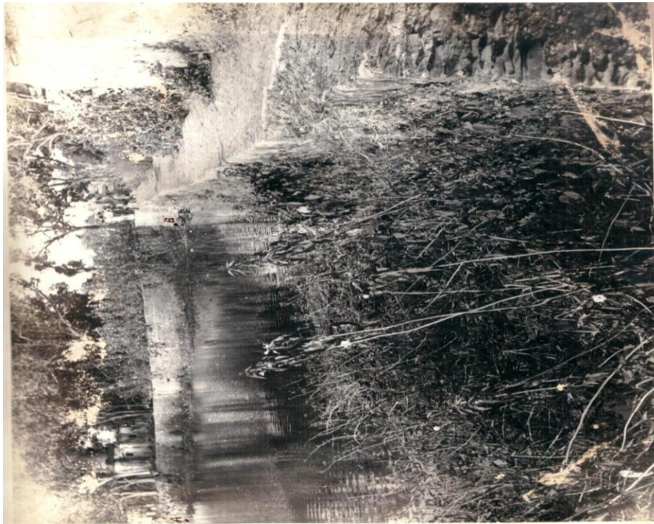
FIG-1 . A PHOTOGRAPH OF BENISAGAR LAKE SHOWING STATIONS A and B STATION A - North side STATION B - East side